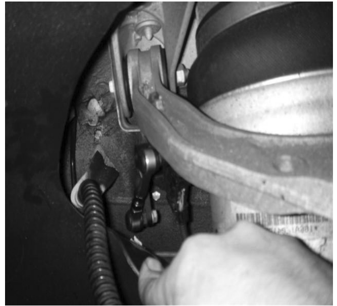
Adjustable Link installed