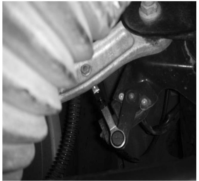
Adjustable Link installed