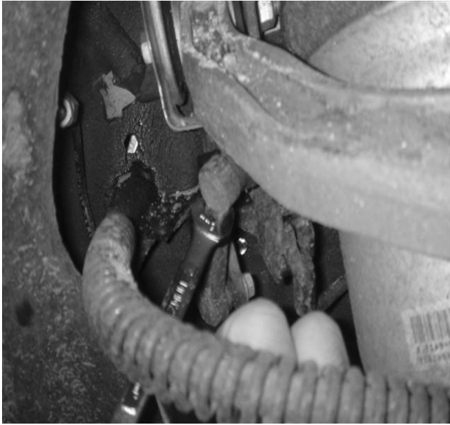
Front Stock Link removal