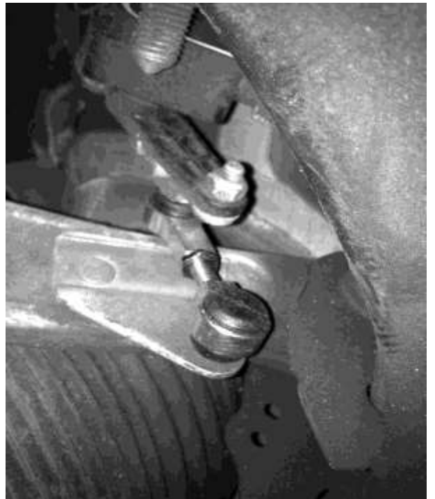
Rear Adjustable Link