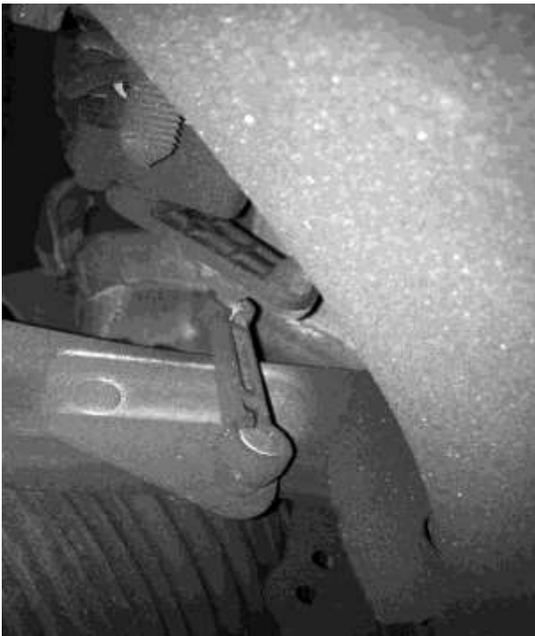
Rear Stock Link