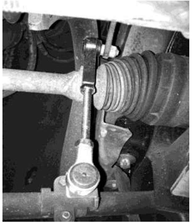
Front Adjustable Link