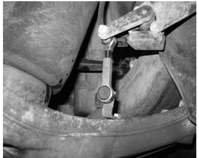
Rear Adjustable Link Installed