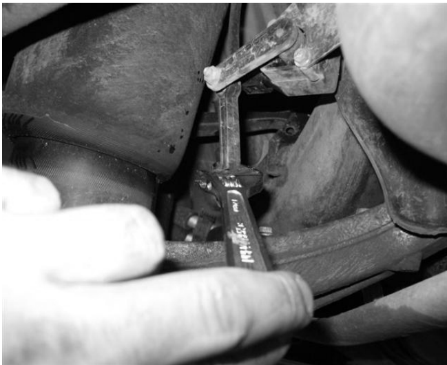
Rear Stock Link removal