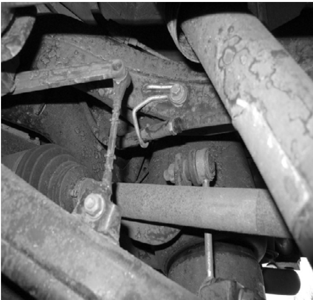
Rear Stock Link