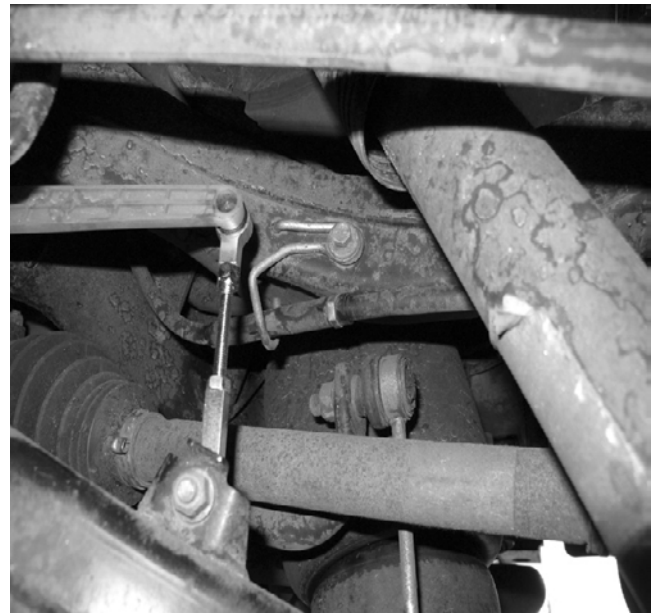
Rear Adjustable Link

Always looking to add more pictures of vehicles to the site. If you would like yours on there they can be uploaded from the site or send them to john@adjustableairride.com