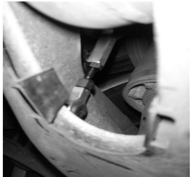
Rear Adjustable Link installed