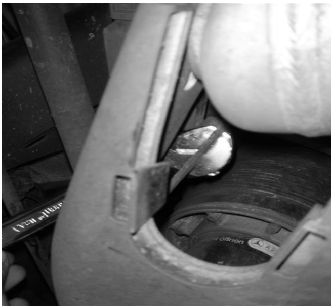
Rear Stock Link Removal