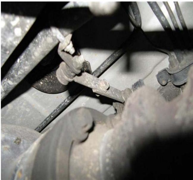
Rear Factory Link