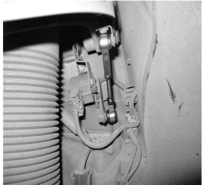
Front Adjustable Link installed