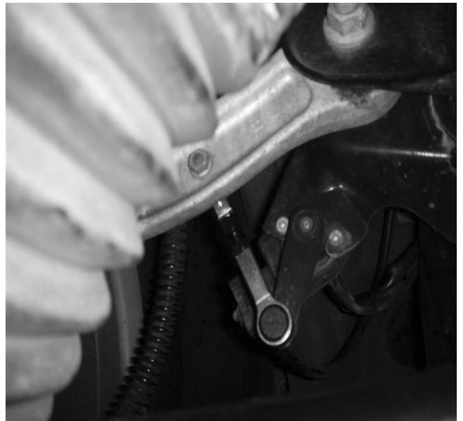
Adjustable Link installed