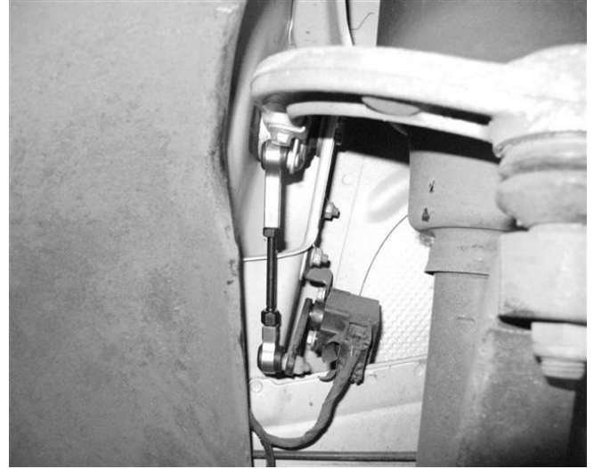
Front Adjustable Link installed