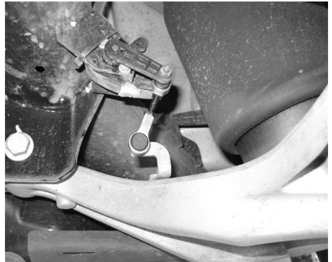
Rear Adjustable Link Installed