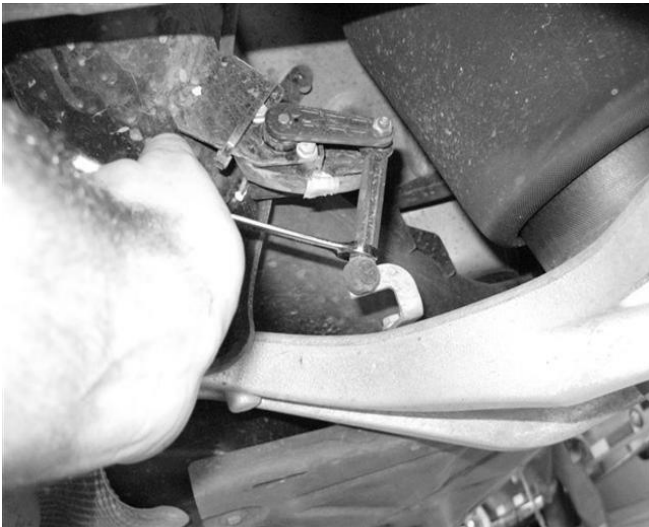
Rear Stock Link removal