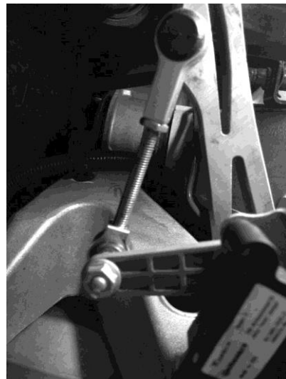
Rear Adjustable Link installed