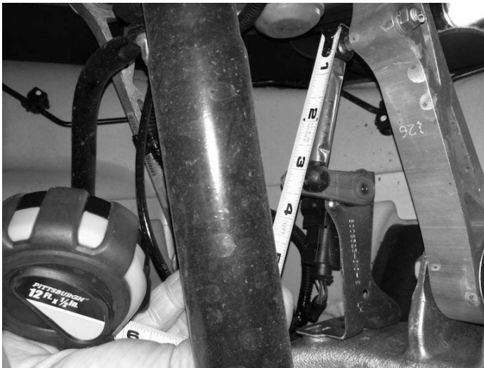
Rear Stock Link removal