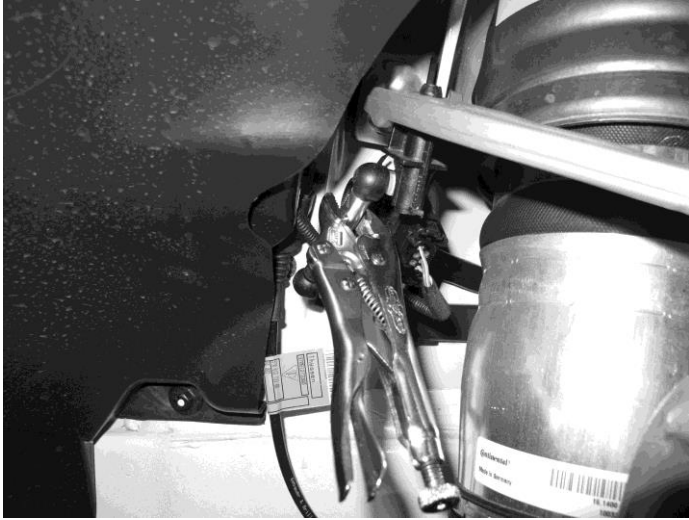
Front Stock Link removal